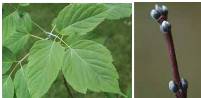
*Paul Wray, Iowa State University

Exhibits opposite branching and compound leaves. However, has 3 to 5 leaflets (instead of 5 to 11) and the samaras are always in pairs instead of single like the ash.